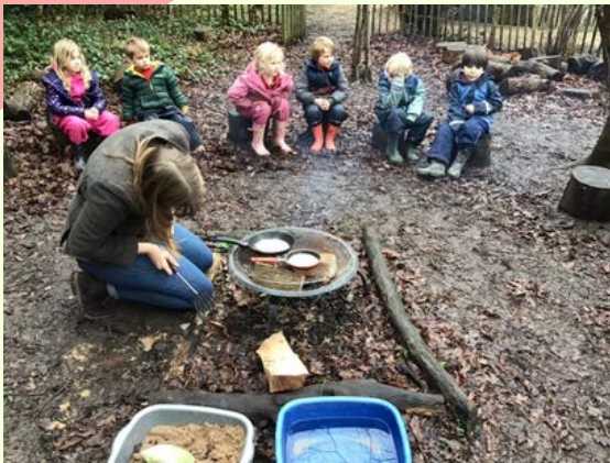
The problem of the Gruffalo pancakes!

We have all encountered problems to solve, through our curriculum experiences and special events, developing our skills in this area.