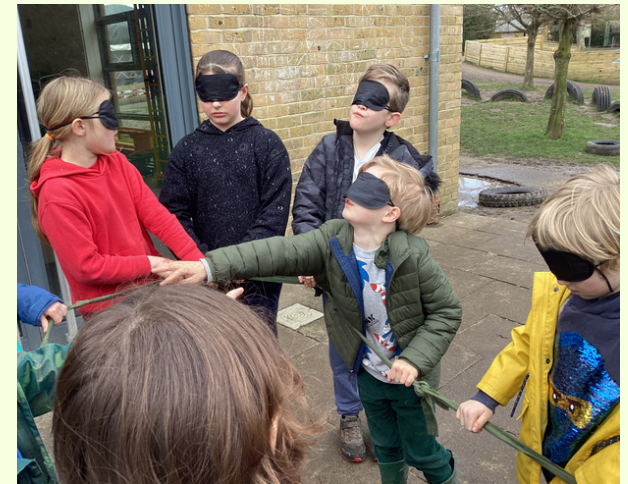
How to make a square -- when no one can see what they're doing!