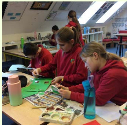
Year 6's electric buggies provided plenty of problem-solving challenges...